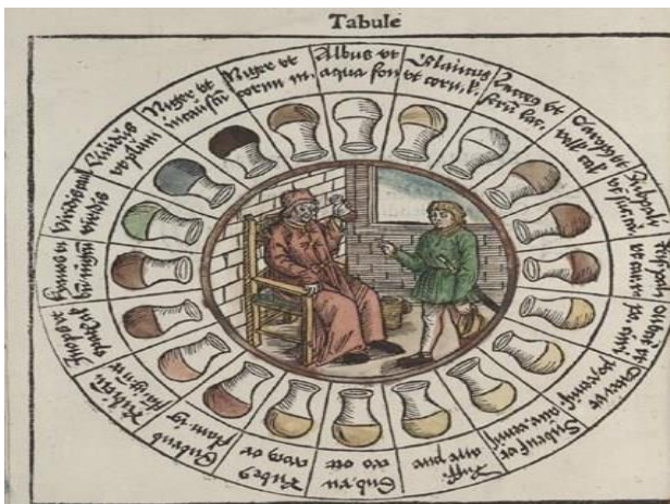
Urine Colour Wheel used in Medieval Times