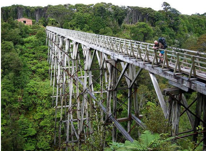
World's Largest Wooden Viaduct

Get your brochure by Email at armadillo228@outlook.com or go to our website: www.u3ainvercargill.nz