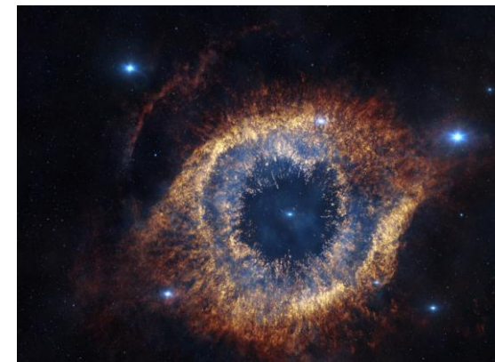
Eye in the Sky