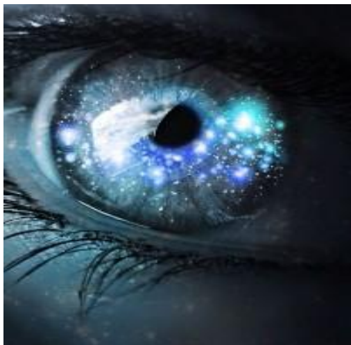
Eye on the Sky