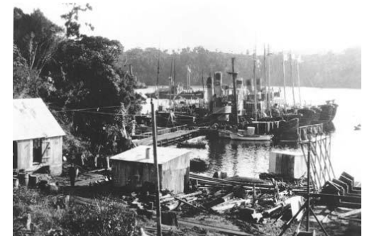
Norwegian Whaling Base Rakiura

is the study of the ancient and recent human past through material remains. It is a subfield of anthropology , the study of all human culture.