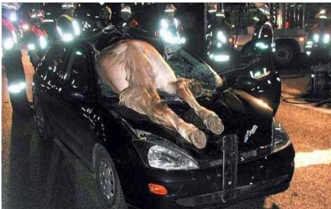
Horsepower meets Horse Power

Get your brochure by Email at armadillo228@outlook.com or go to our website: www.u3ainvercargill.nz