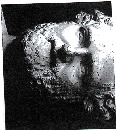
Aristophanes 446 BC – 386 BC The Father of Humour