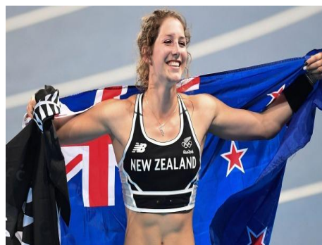
What a Year