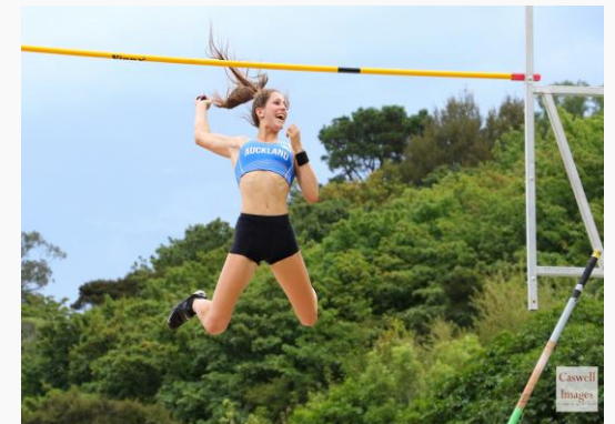
Bring on 2017